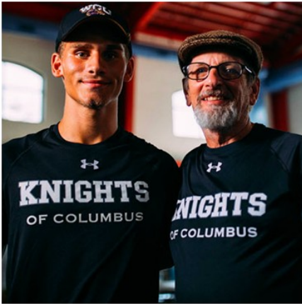
Join the Knights