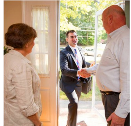
Choose the right policy