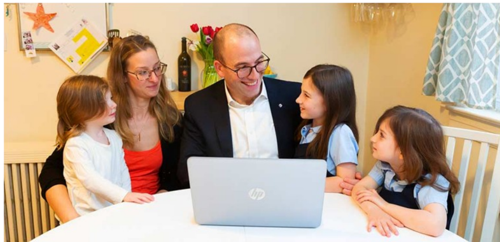
Family peace of mind