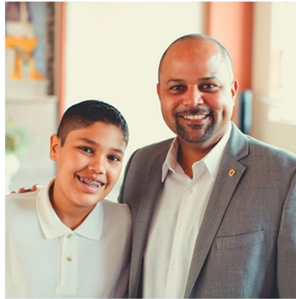
Meet your agent